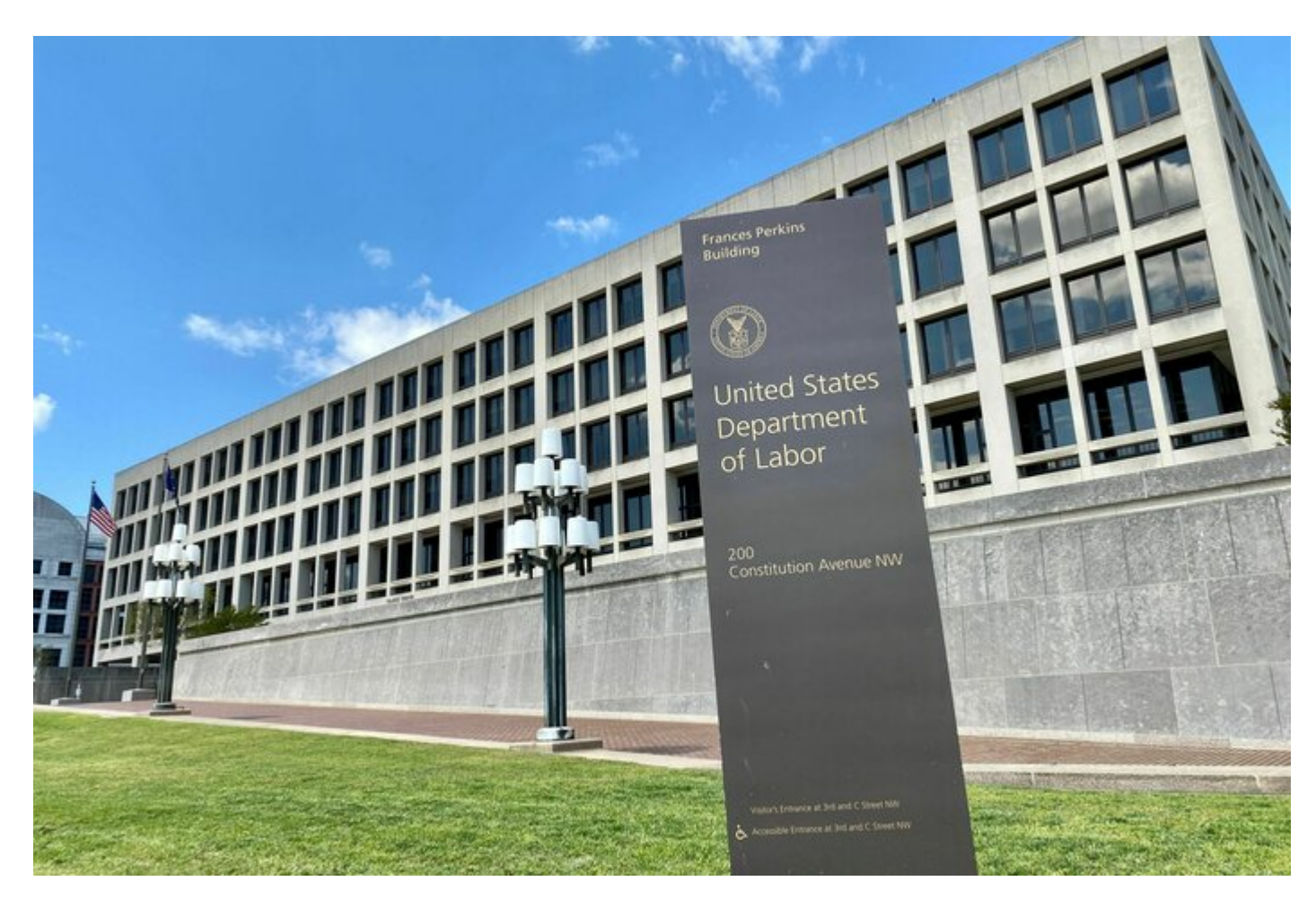
The DOL and a worker struck a deal to end the worker's suit alleging that the department denied him a promotion because he was Black and straight and that his boss favored white LGBTQ employees.

The <u>U.S. Department of Labor</u> has struck a deal to end a Black, straight worker's lawsuit alleging he was denied a promotion at the DOL because his boss — a member of the LGBTQ community — preferred white and LGBTQ employees, the parties told a D.C. federal court Tuesday.